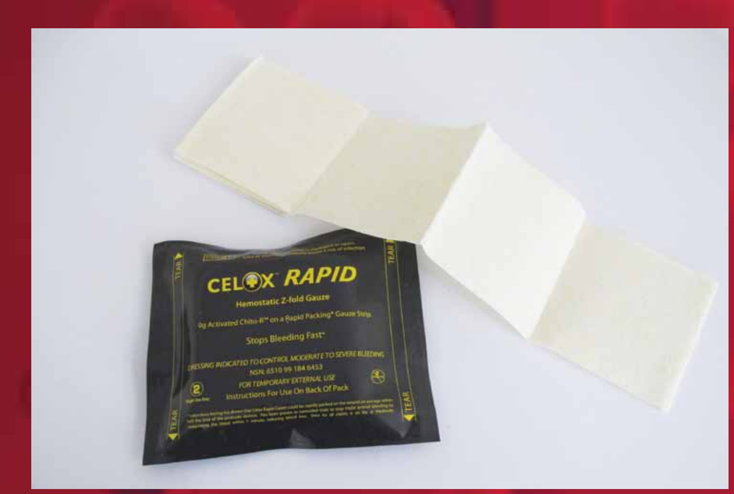
Figure 1 – New hemostatic dressing

The objective of this study is to assess the efficacy of this new rapid haemostatic gauze without applying any compression and after a short (one minute) compression time using a model of severe arterial hemorrhage.