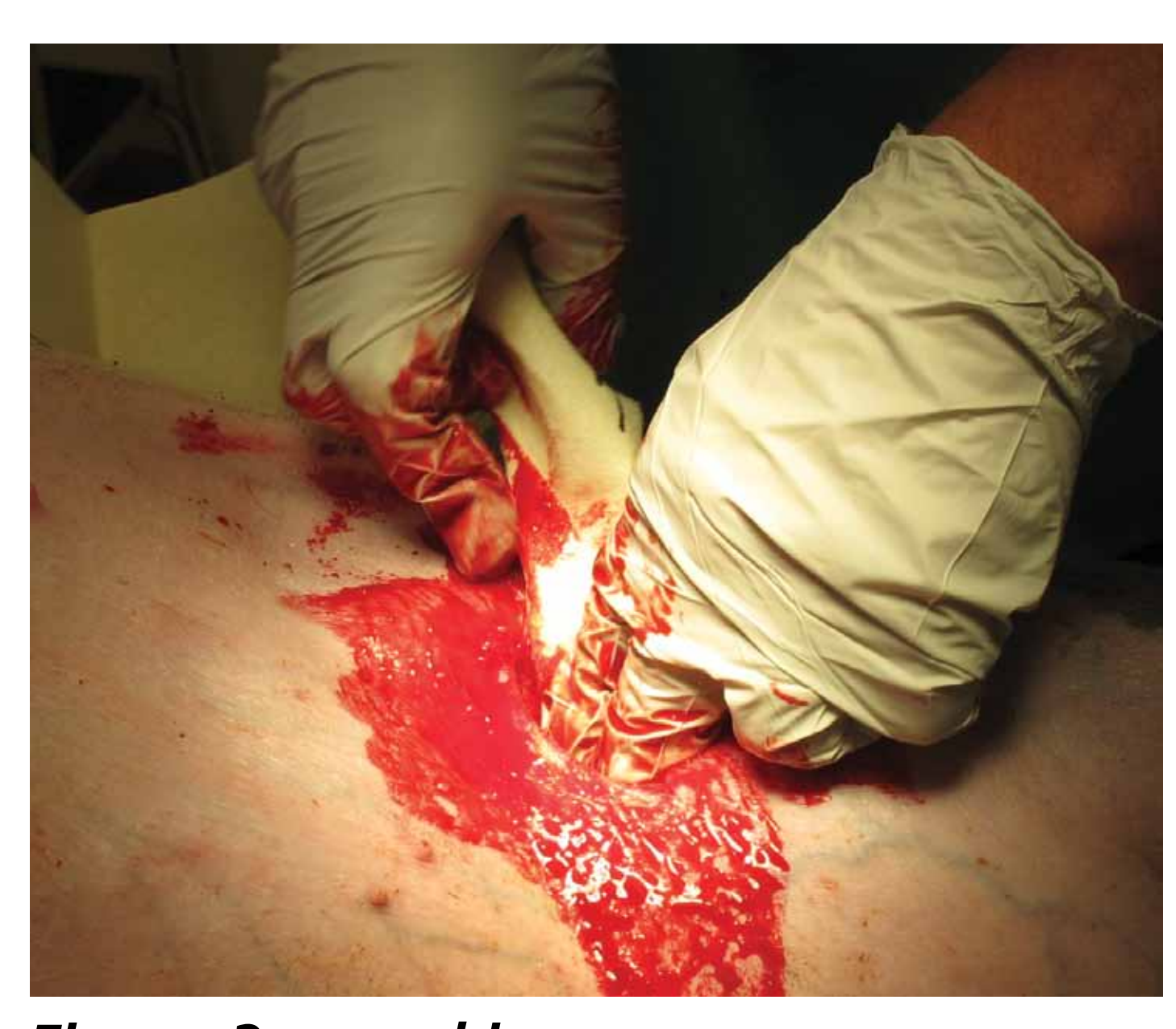
Figure 2 – packing.

Additional tests were carried out on Celox Rapid at three minutes' compression (current TCCC guideline) to provide a baseline.